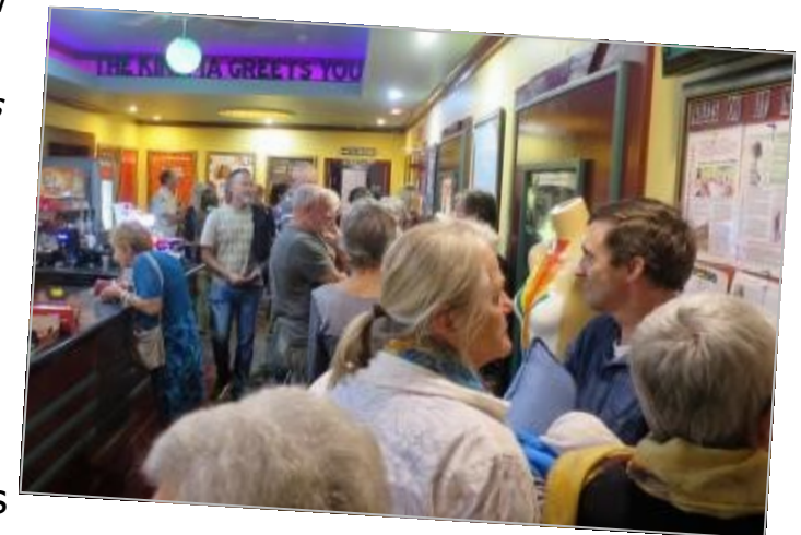
Foyer congestion was an issue