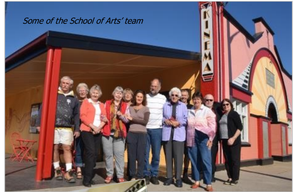
Some of the School of Arts' team

It is already bringing greater cross generational entertainment, social inclusion, a sense of pride of place, and boosting the town's economic development.